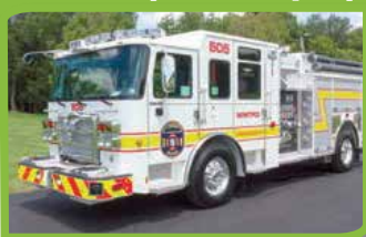
Lincolnway Fire Company