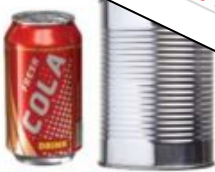
CANS Aluminum & Steel