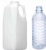
PLASTIC Bottles & Jugs 1, 2 & 5