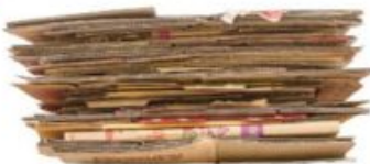
CARDBOARD Dry & Flattened No Food Contact