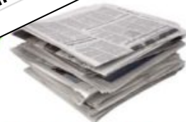
NEWSPAPER Clean & Dry No Food Contact