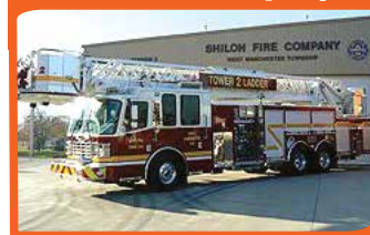
Shiloh Fire Company

• DOORS OPEN AT 12 – BINGO AT 2 PM • $15 IN ADVANCE • $20 AT THE DOOR • CALL 717-870-2503